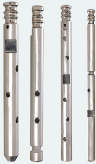
Tractor GearBox Parts