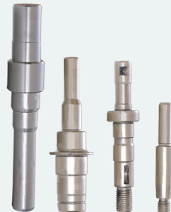
Oil and Water pump Shafts